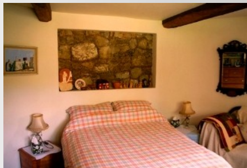
Bed & Breakfast Website, Kent